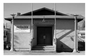
With assistance from the Inyokern Chamber of Commerce